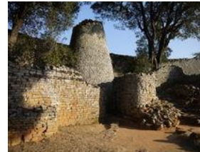
Zimbabwe Diaspora Network - UK